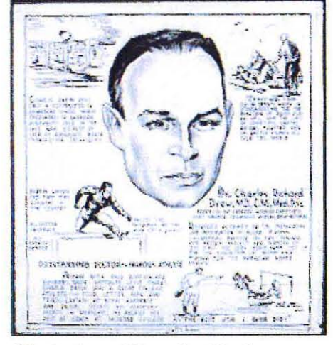
Illustration of Drew by Charles Alston in the collection of the National Archives

A persistent urban legend (even recounted in an episode of the TV show M*A*S*H and Philip Roth's The Human Stain ) holds that Drew was denied care — ironically, a blood transfusion —